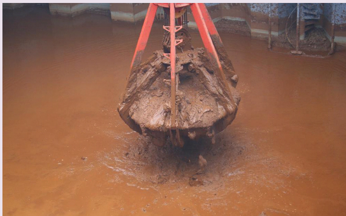
Liquefied nickel ore

You can find the Group for a particular cargo in its schedule.