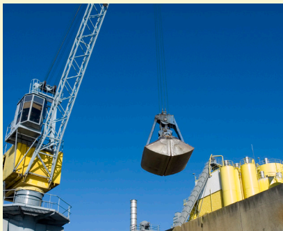
Cargo being worked