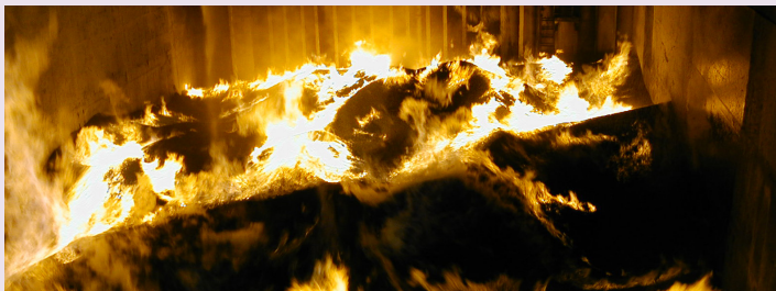
DRI which has self heated

Corrosion can be caused by some Group B cargoes and their residues. A coating or barrier may need to be applied to the cargo space structures before loading. Before loading and unloading corrosive cargoes, make sure the cargo space is clean and dry.