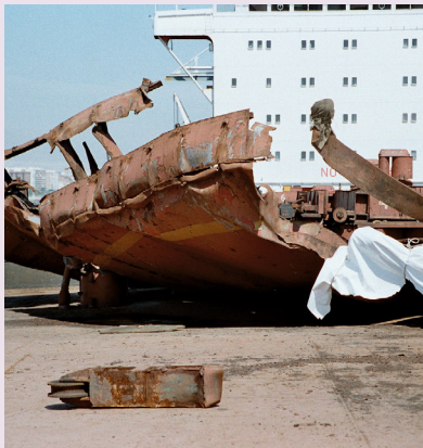
The damage caused by a DRI explosion

Wood products transported in bulk are listed in a new schedule to the Code: Wood Products – General. They include logs, pulpwood, roundwood, saw logs and timber. These cargoes may cause oxygen depletion and increase carbon dioxide in the cargo space and adjacent spaces.