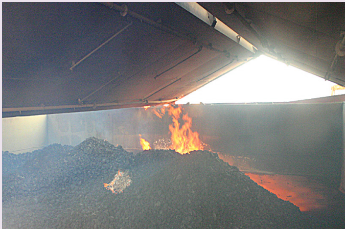
Coal on fire in a cargo hold