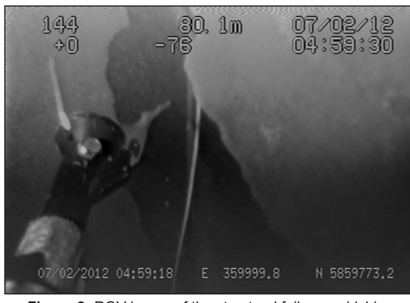
Figure 2: ROV image of the structural failure amidships

On 27 November 2011, the master and five of the crew from the 34-year old general cargo ship Swanland were lost when the vessel foundered about 17 minutes after suffering a structural failure amidships. The failure occurred as the vessel was heading directly into a south westerly gale in rough to very rough seas. Only the second officer and an AB survived. Underwater surveys confirmed that the vessel had suffered a structural failure amidships ( Figure 2 ).